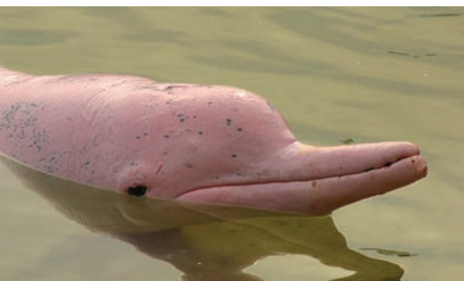
A pink dolphin floats above the Amazon River

This morning disembark in Iquitos and head to the Manatee Rescue Center to learn about the conservation efforts currently in action for these gentle creatures. Find out about the manatee's importance in the ecosystem, and see why it is so important that these orphaned pups are reintroduced to the river. In the afternoon you will fly back to Lima and upon arrival you will be escorted to your hotel, the COSTA DEL SOL WYNDHAM, where a dayroom is reserved for you. A farewell dinner will be served at the hotel. Later tonight, transfer to the airport for your overnight flight to the USA. Arrive back home after experiencing a unique world, one that combines the thrill of ancient civilizations and amazing natural history.