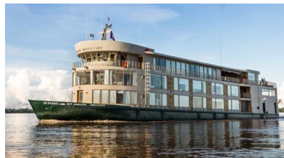
The Amazon Discovery afloat on the Amazon

"Imagine a man without lungs. Imagine earth without the Amazon rainforest."