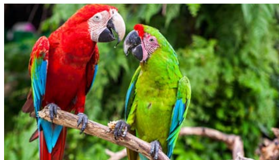
A pair of macaws being social in the rainforest