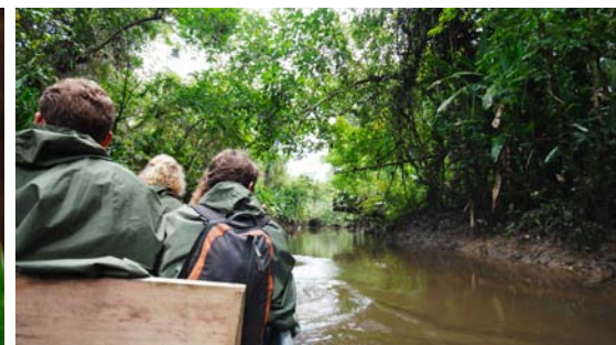
Floating along the Amazon River in a canoe