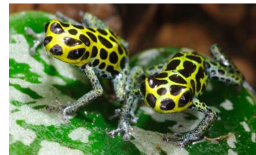
A pair of Ranitomeya Imitators on a lily pad